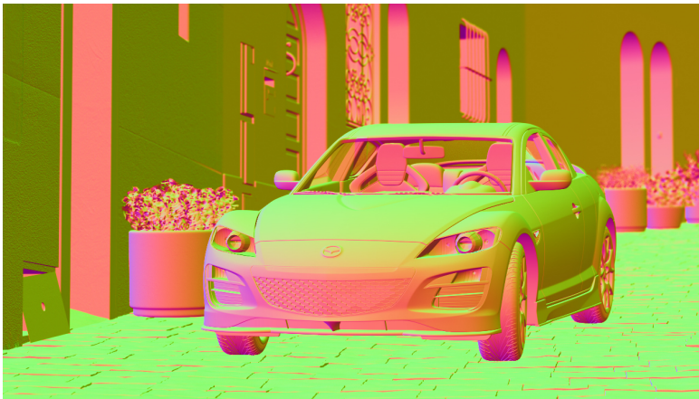
Figure 3.6 – Example normal image obtained using the first diffuse or glossy (non-delta) hit. Note that the normals of perfect specular (delta) transparent surfaces are computed as the Fresnel blend of the reflected and transmitted normals.