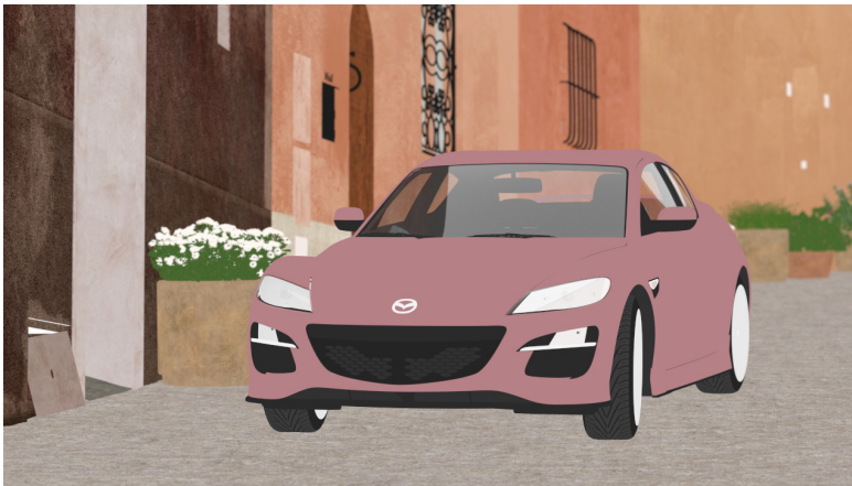
Figure 3.4 – Example albedo image obtained using the first diffuse or glossy (non-delta) hit. Note that the albedos of perfect specular (delta) transparent surfaces are computed as the Fresnel blend of the reflected and transmitted albedos.