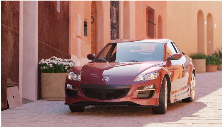
Figure 3.1 – Example noisy color image rendered using unidirectional path tracing (512 spp). Scene by Evermotion.